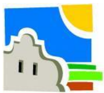
Tourist organization of Vojvodina