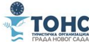
Tourist organization of Novi Sad