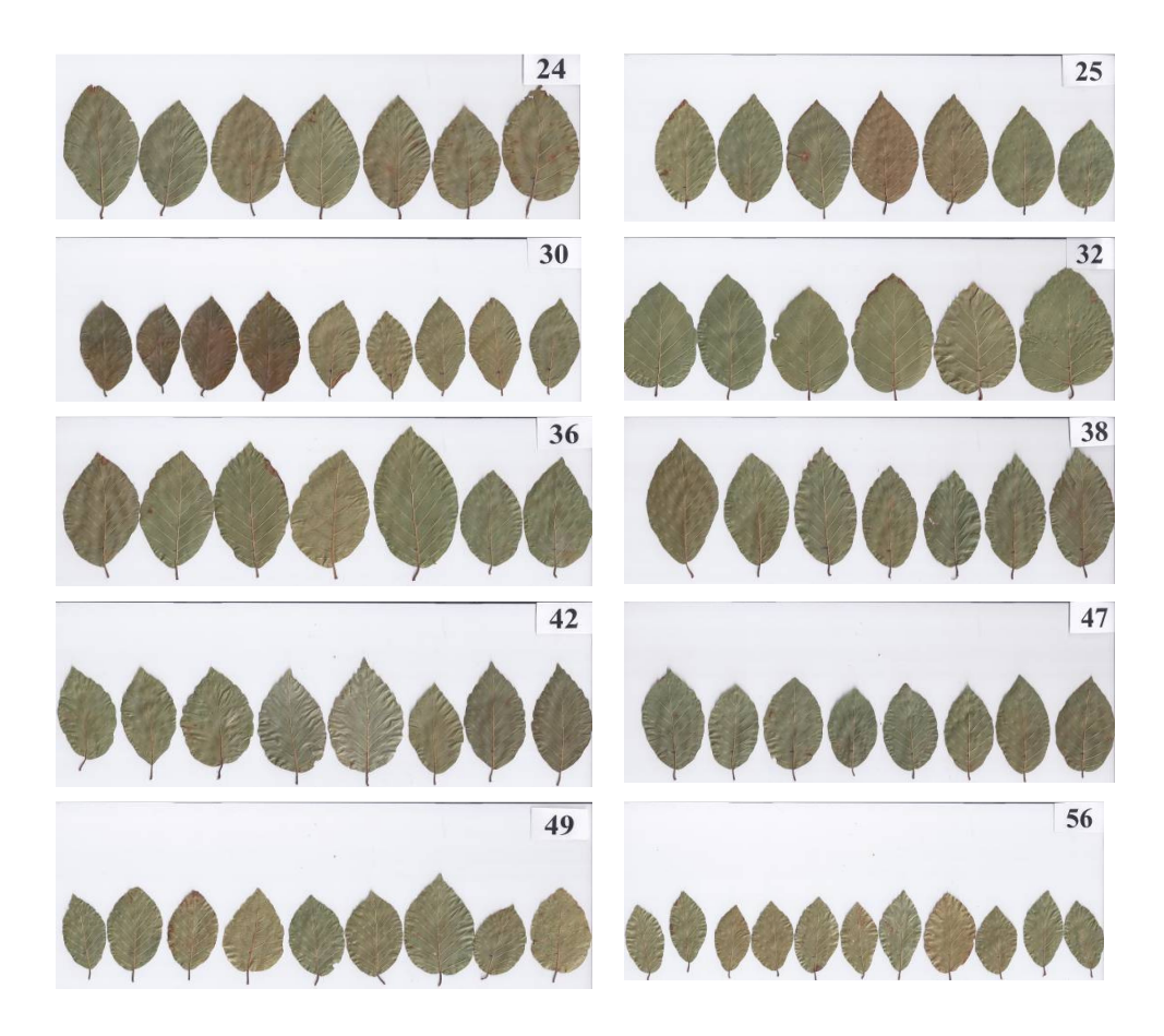
Figure 2. Variability of beech leaves from different provenances

According to the diagram of cluster analysis (Diagram 1), it can be concluded that the shortest linkage distance is recorded between Serbian (36) and Croatian (24 and 25) provenances, and two German provenances (47 and 42).