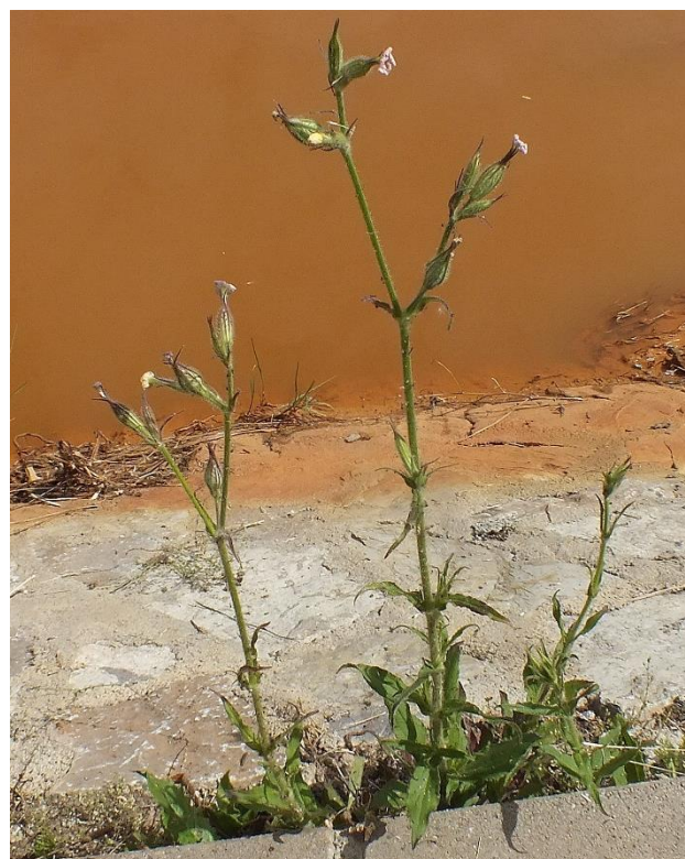
Fig. 2. Habitat of species Silene noctiflora L., on the locality Gračanika stream

detected and appropriately identified. The floristic structure in the Gračanika river locality can be seen from next phytocenological record: Typha latifolia L. 4.4., Polygonum lapathifolium L. +.1, Arenaria serpyllifolia L. 1.1., Mentha aquatica L. +, Polygonum aviculare L. +, Convolvulus arvensis L. +, Stellaria media L. (Vill). +. Floristic deficiency in this locality is due to the fact that the river banks (or riverbed) are paved by stony blocks so that only a few number of species have managed to inhabit them (Fig. 2).